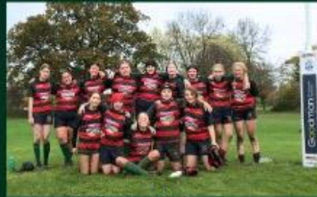
U14W Years 8 & 9