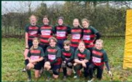
U11W & U12W Years 5, 6 & 7