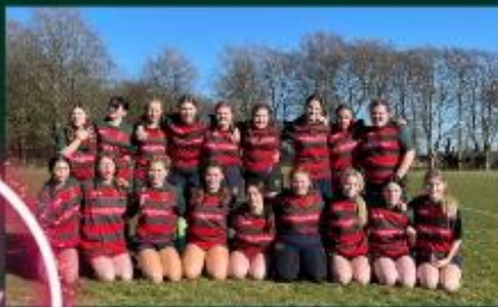
U16W Years 10 & 11