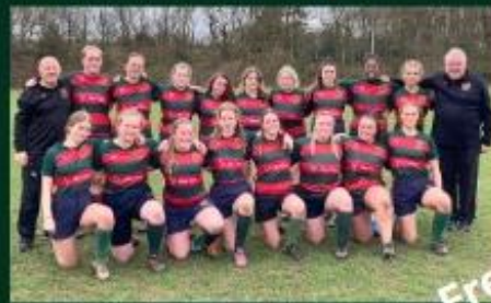
U18W Years 12 & 13